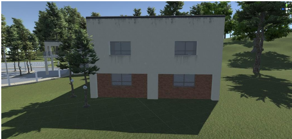
Figure 4 Nursing Home – Sides B (Unity View)