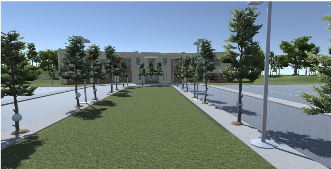
Figure 1 Nursing Home Model (Unity Render)