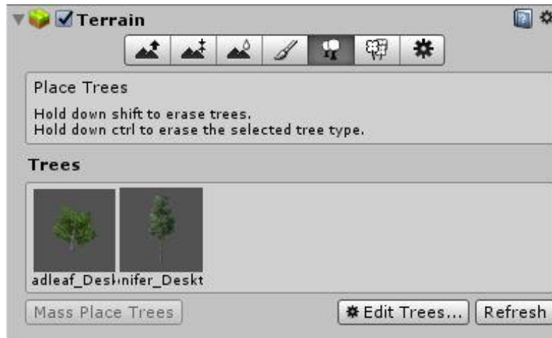
Figure 10 Unity Terrain Panel

In the Inspector you will see the Terrain panel. The Terrain toolbar has 7 buttons on it as seen in Figure 8 below.