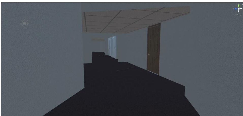
Figure 8 Nursing Home – Second Floor