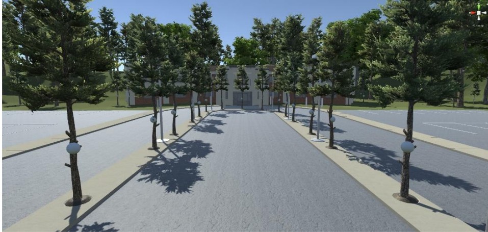
Figure 3 Nursing Home – Side A (Unity View)

This model was imported into Unity 5.5 to verify the model (see Figure 3 below).