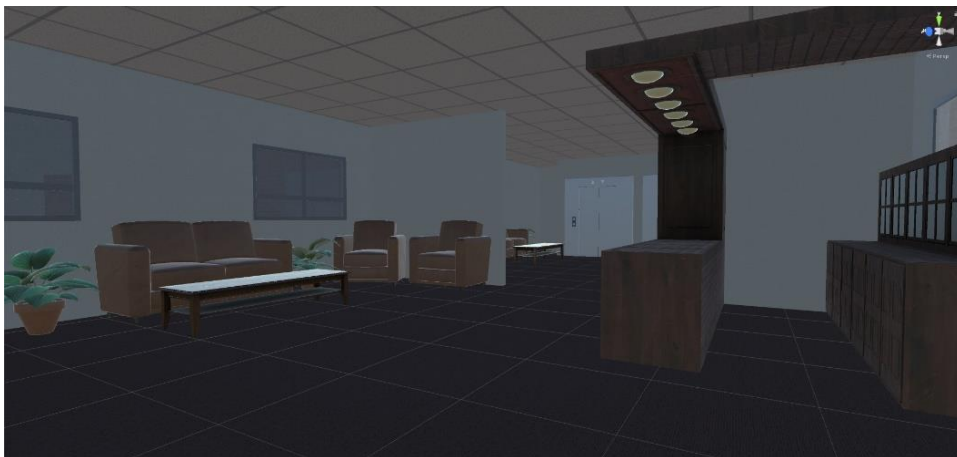
Figure 7 Nursing Home – First Floor