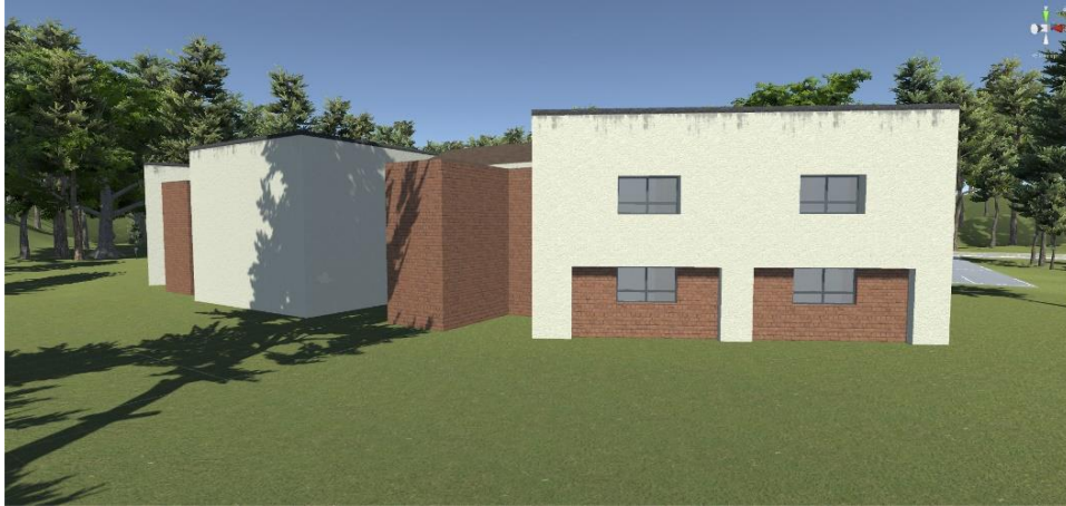
Figure 6 Nursing Home – Side D (Unity View)