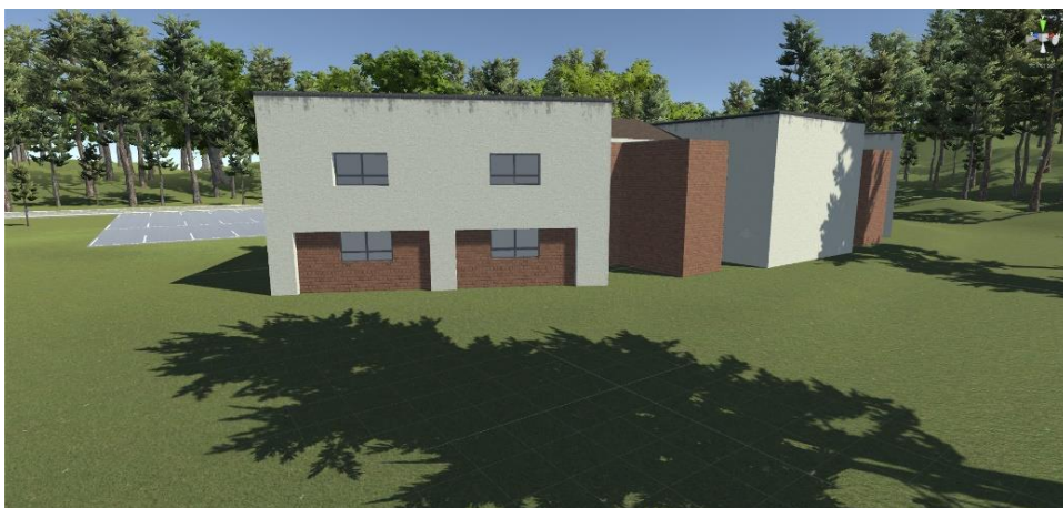
Figure 5 Nursing Home – Side C (Unity View)